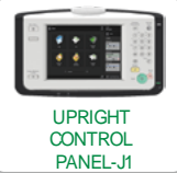
UPRIGHT CONTROL PANEL-J1