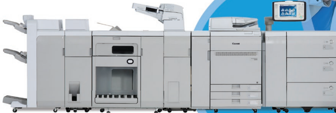
imagePRESS C910 shown with optional accessories.

Incorporated into this colour digital press is Canon's passion and unique understanding of imaging, photography, colour science, and workflow. This expertise has resulted in a high-quality digital press that's both productive and versatile for printing establishments of varying shapes and sizes.