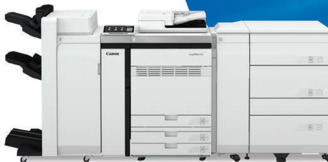
imagePRESS V900 shown with optional accessories.