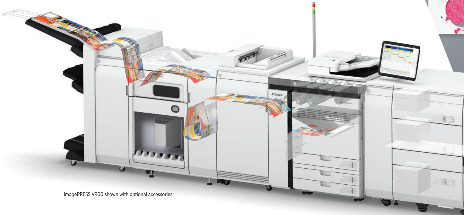
imagePRESS V900 shown with optional accessories.