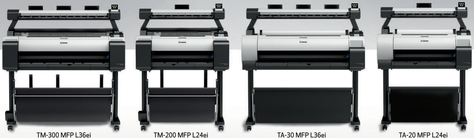
TM-300 MFP L36ei

Free Layout Plus: Nest, tile, and create custom layouts before printing your files with this print utility. Use the Plug-in feature to print directly from Microsoft office programs.