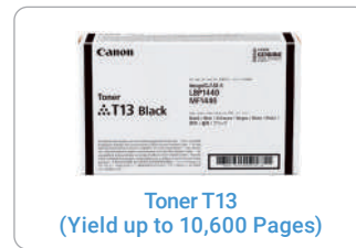
Toner T13 (Yield up to 10,600 Pages)

Use of Canon GENUINE toner cartridges helps provide longer equipment life, high yields, reliable performance, high-quality output, and minimal jamming or issues.