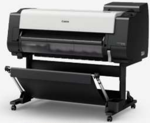
imagePROGRAF TX-3100 Printer with Multipositional Catch Basket