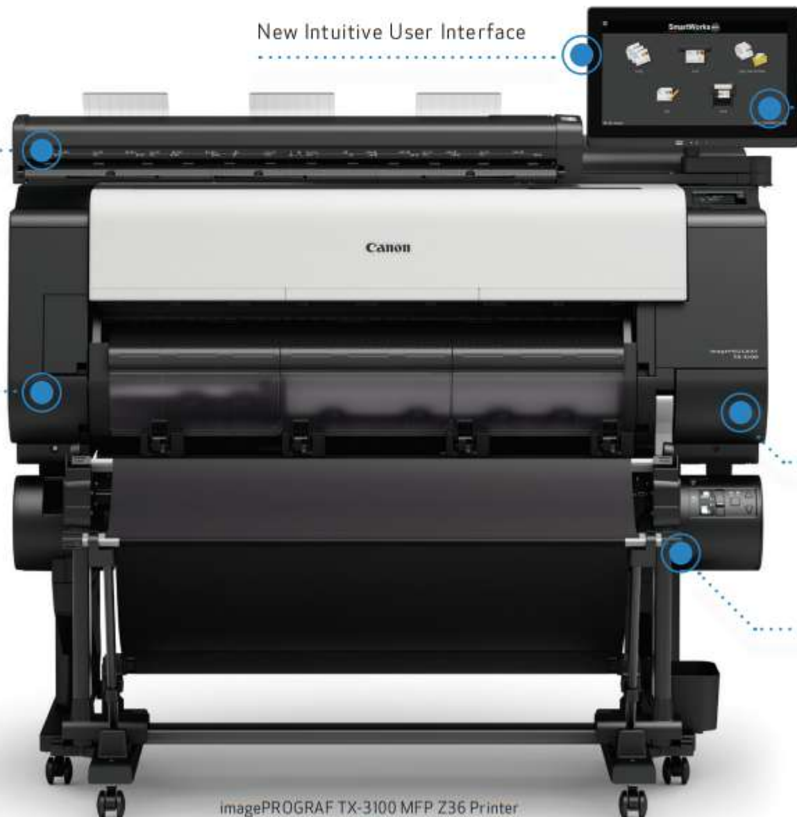
imagePROGRAF TX-3100 MFP Z36 Printer Shown with TX Stacker and Optional MFR