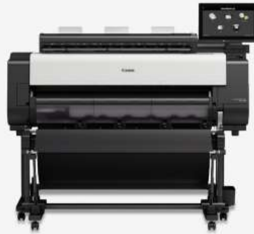
imagePROGRAF TX-4100 MFP Z36 Printer with TX Stacker

•44" imagePROGRAF TX-4100 MFP Z36 Scan-to-Copy/File/Share Solution