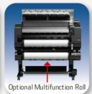
Optional Multifunction Roll