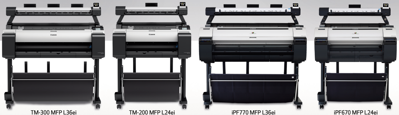
TM-300 MFP L36ei

Free Layout Plus: New! Nest, tile, and create custom layouts before printing your files with this print utility. Use the Plug-in feature to print directly from Microsoft office programs. Compatible with the TM-300 and TM-200 models only.