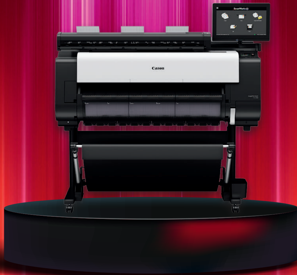
imagePROGRAF TX-3200 MFP Z36