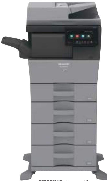
BPB550WD shown with Inner Finishing Unit in a 4-drawer configuration.