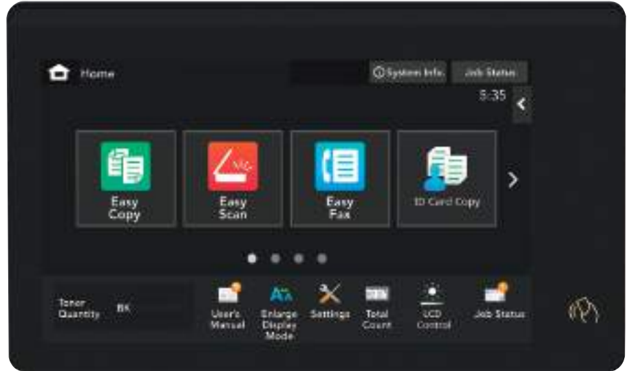
7" (diagonally measured) customizable touchscreen display.