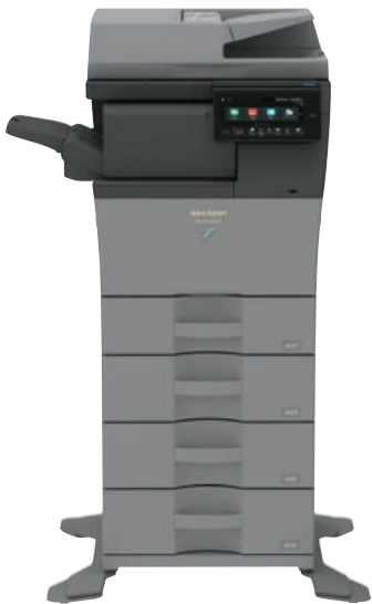
BPC545WD shown with Inner Finishing Unit in a 4-drawer configuration.