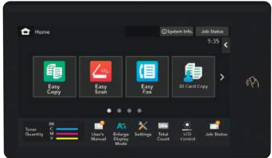
7" (diagonally measured) customizable touchscreen display.