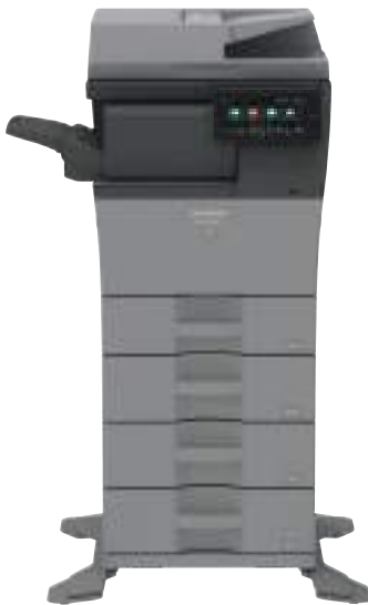
BPC545WD shown with Inner Finishing Unit in a 4-drawer configuration.