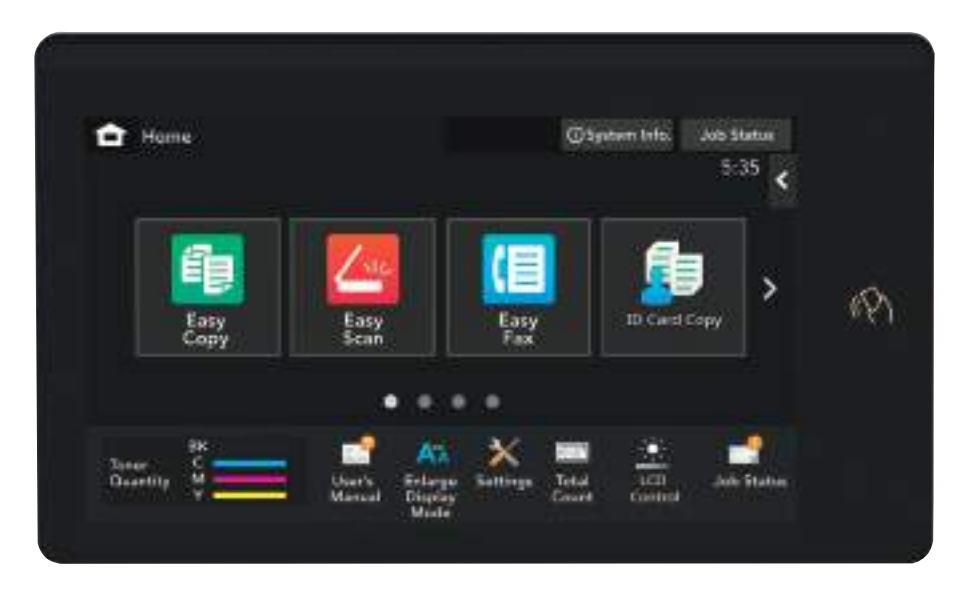
7" (diagonally measured) customizable touchscreen display.