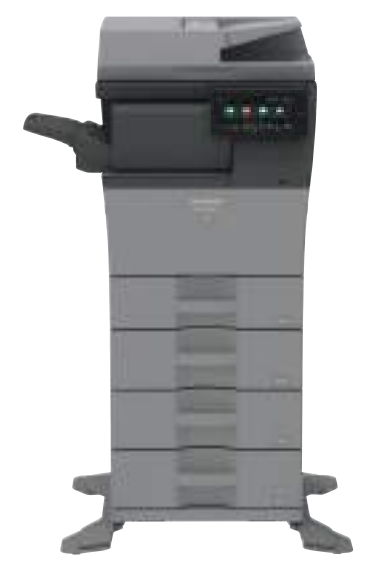
BPC545WD shown with Inner Finishing Unit in a 4-drawer configuration.